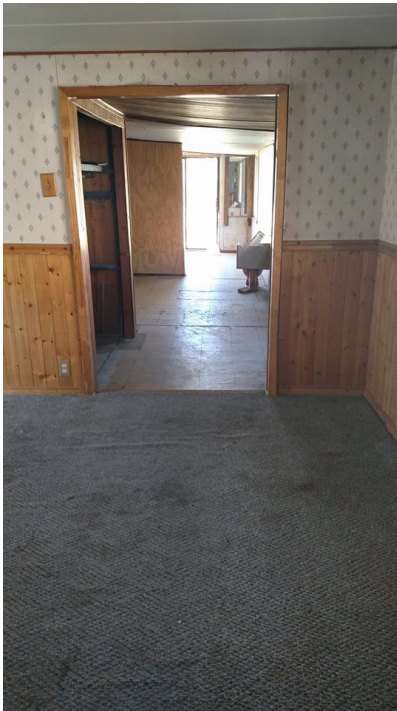
Front part of house cleaned & sanitized.