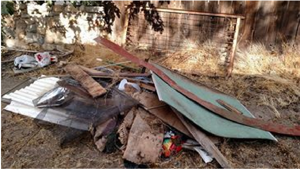
9-1-2015: Began removing garbage from both houses.