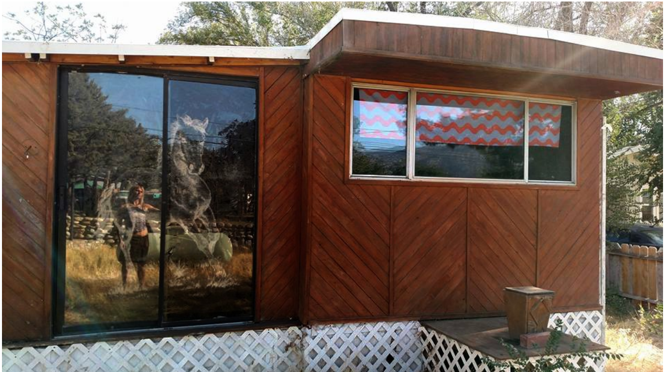
The couple instantly began improving the aesthetic value, safety, & functionality of the property from the first day they moved in.