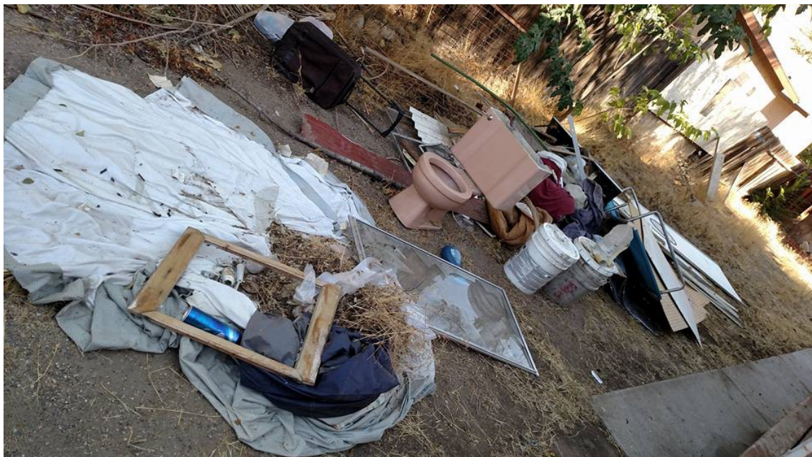
9-5-2015: More garbage & recyclables gathered & removed from premises.