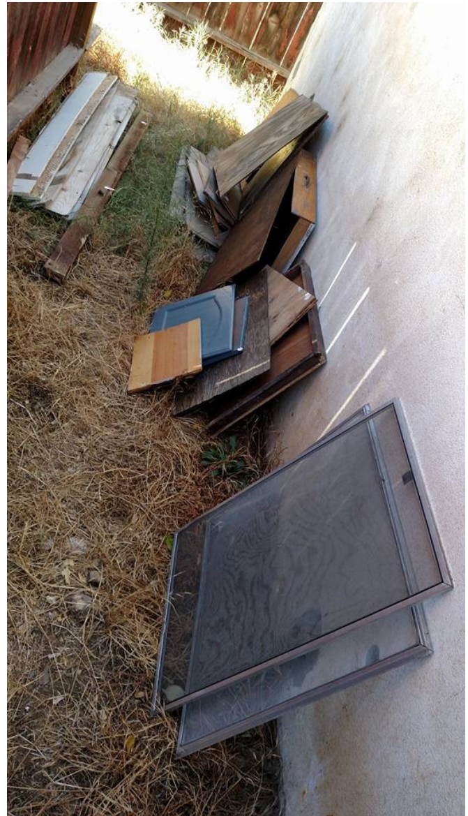
Wood scraps & building materials organized along east side of rear building.