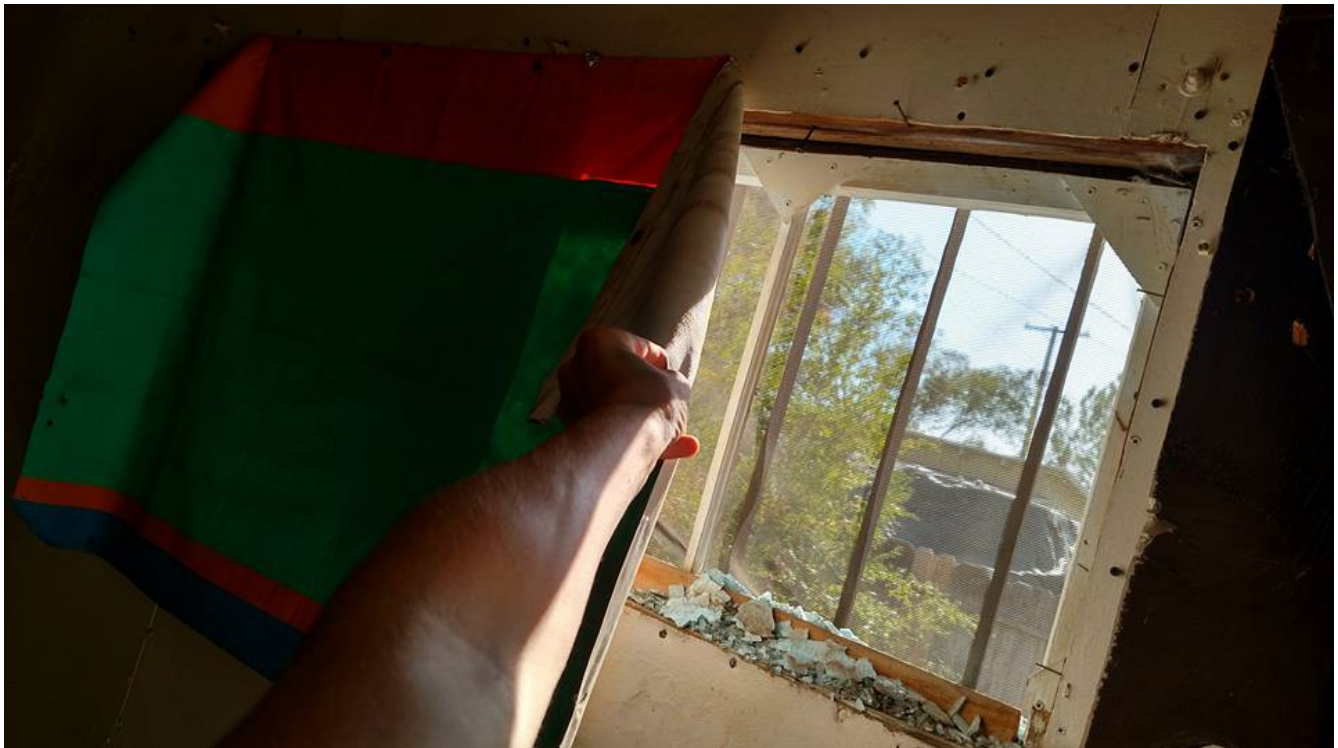
Cleaned broken glass from window in rear building.