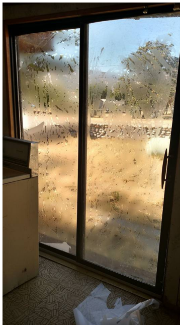
Peeled off "peeling white plastic" from front sliding doors; see pages 2-4 for "BEFORE" photos.