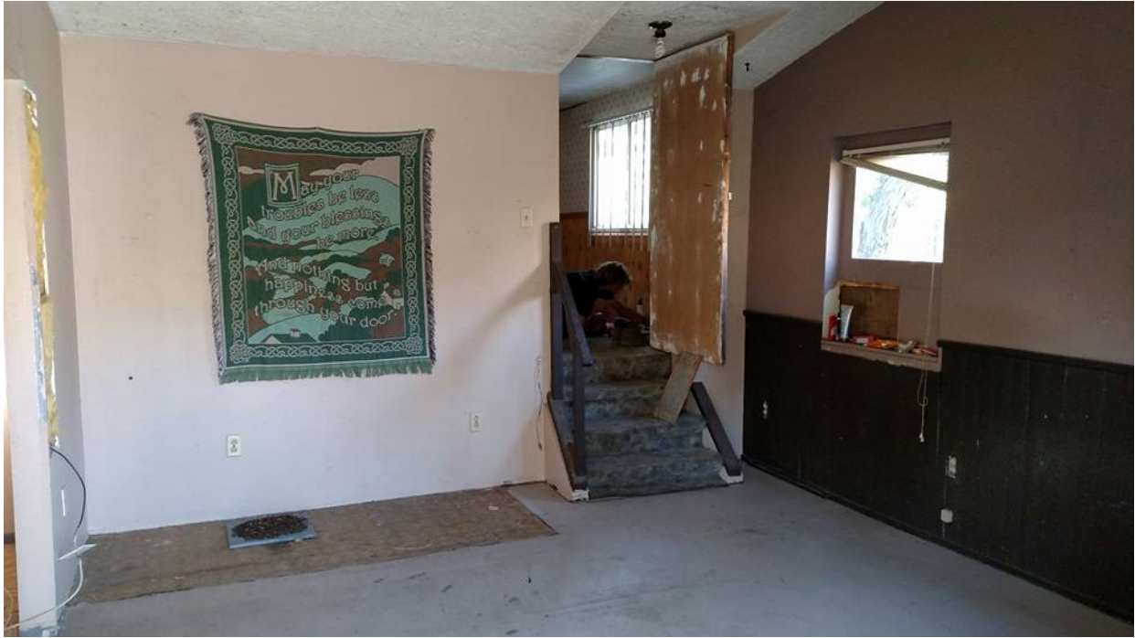
Back room cleaned & sanitized.