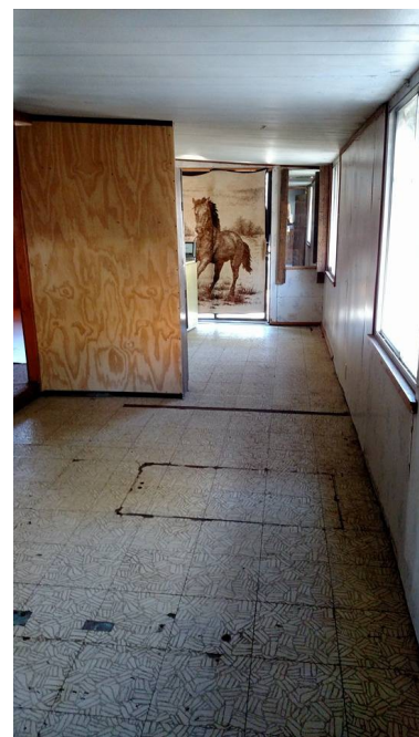
Mr. Byrd purchased this "horse blanket" to replace the white plastic.