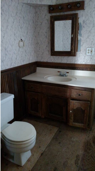
Front restroom in front house cleaned & sanitized.