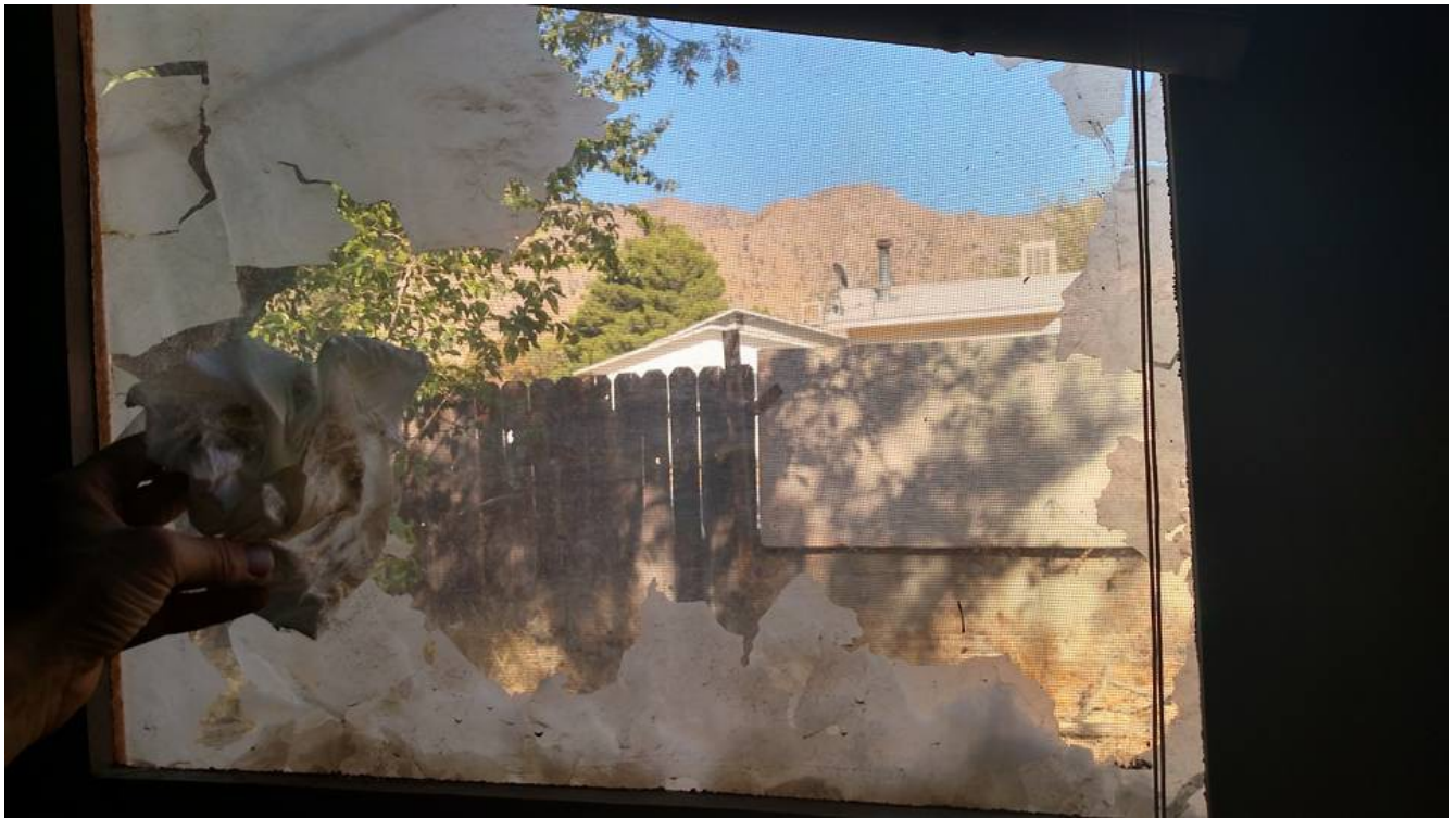
Peeled off the deteriorating plastic on bedroom window. See "outside of window" on page 12.