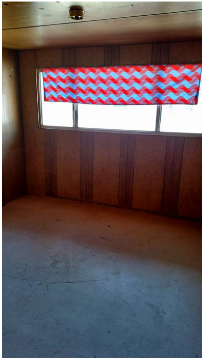
Front bedroom cleaned & sanitized; this cloth was a gift from their neighbors.