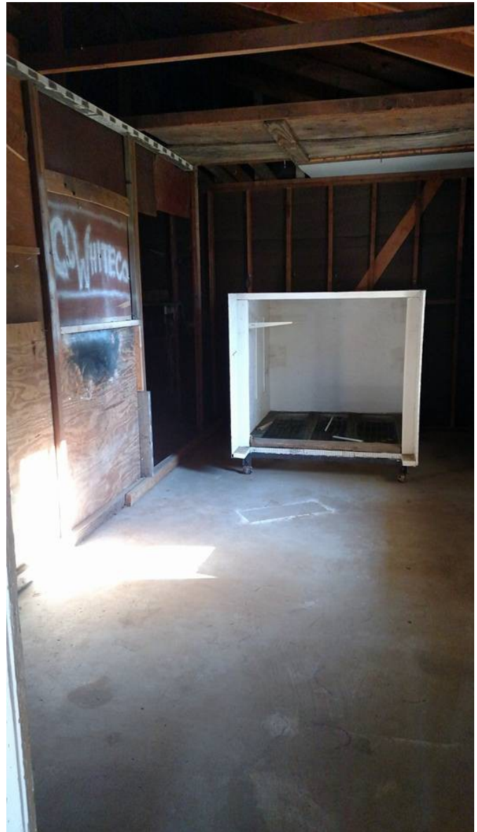
Rear building getting cleaned & sanitized.