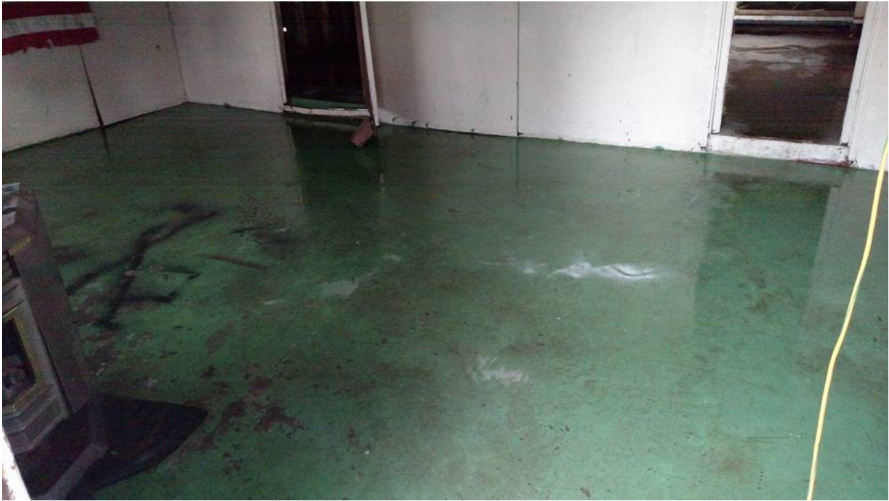
Front room of rear house, cleaned & sanitized (mopped, etc.).