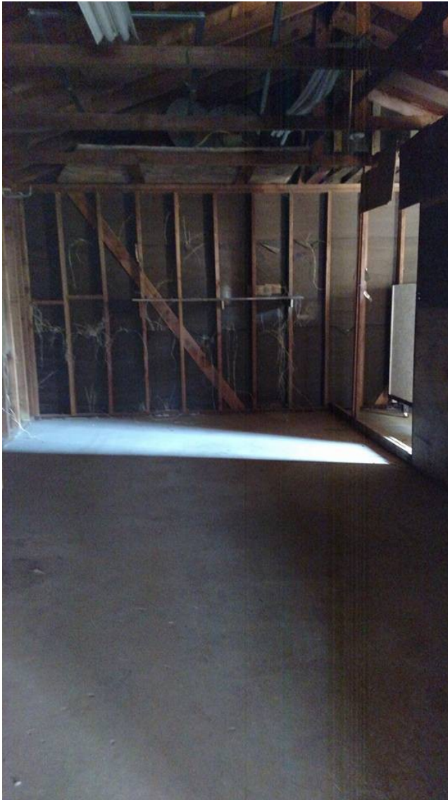
They cleaned the southeast room of the rear building, removing the crazy meat locker doors & washing the floor.